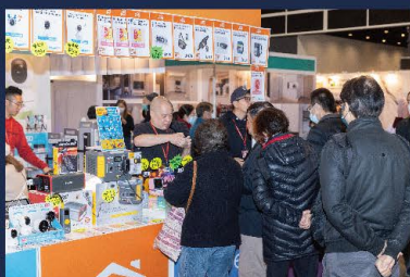
攝影器材及音響 Photographic & Audio Equipment