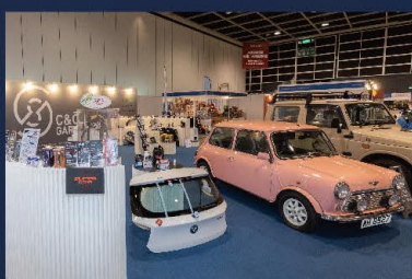
汽車改裝美容服務 Automotive Conversion & Beauty Services Zone