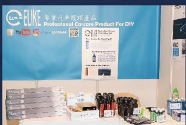
汽車產品及配件 Automotive Products & Accessories Zone