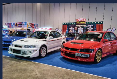
電動及汽車展示 Electric Vehicle & Automobile Display Zone