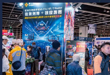
5G電訊科技及電子娛樂消閒 5G Telecommunications & e-Entertainment