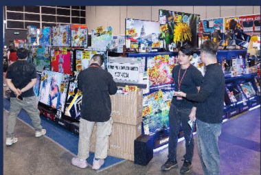
數碼電子產品 e-Digital Products Zone